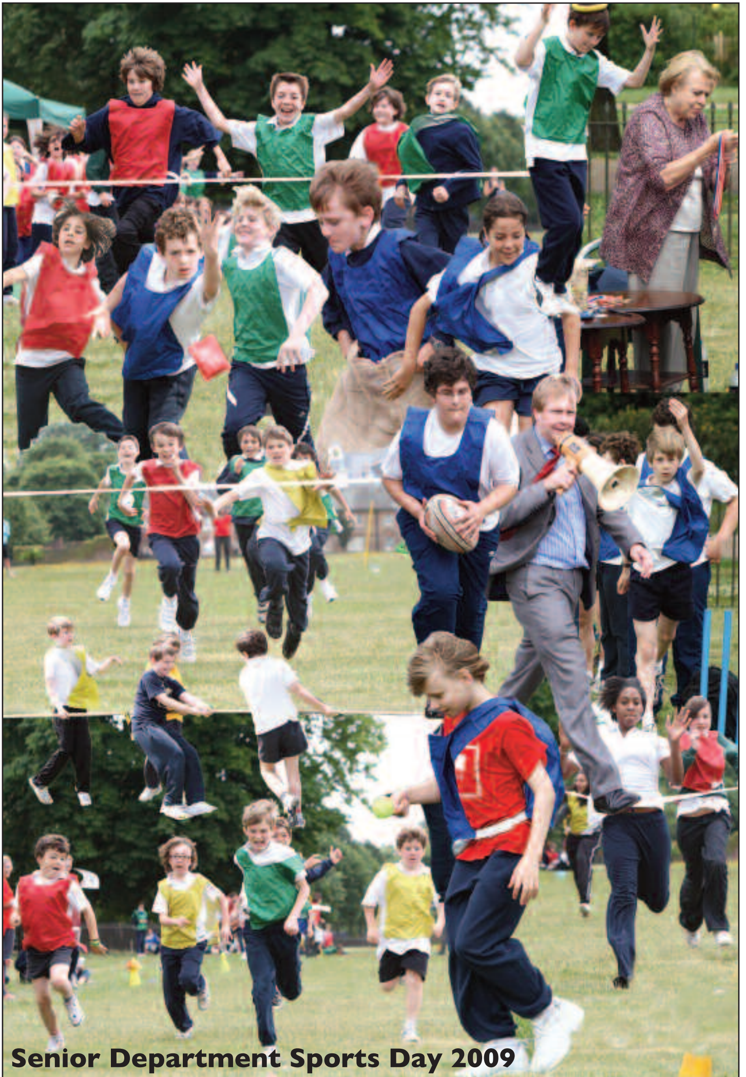
Senior Department Sports Day 2009