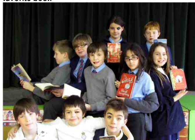
Pupils at Causton Street talked about books they have enjoyed at Friday's assembly

The children at Lambeth Road had a very special day celebrating World Book Day too. All the children came to school dressed as their favourite book character. They all looked so fantastic in their costumes it was a hard decision to choose only one winner and one runner up from each class. The