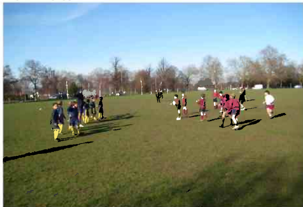
Photo of Fairley House playing in the Rugby match against Oliver House