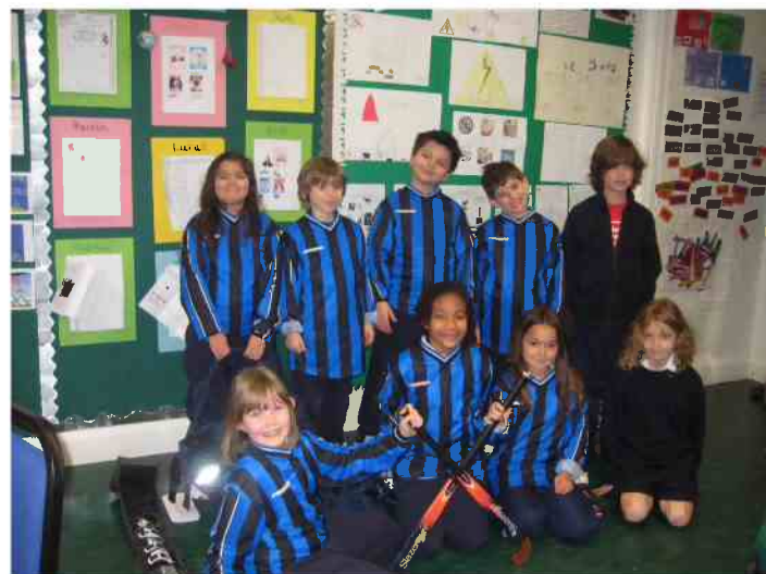
Photo of the Hockey team that played in Monday's Tournament