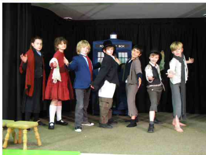
Photo of Branson class acting their Dickensian scene in the Dr Who